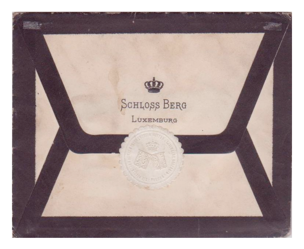
Fig. 4: Official cover endorsed "Service du Grand Duc," posted from the Grand Ducal residence, Schloss Berg, at Colmar-Berg to Wiesbaden (near the seat of the House of Nassau-Weilberg) on March 8, 1912, during the period of mourning for Grand Duke William IV, who had died on February 25, 1912. On the back is the Royal seal. Franked with a strip of three of the four-centime Écusson official, the cover is underpaid 1/2 centime.