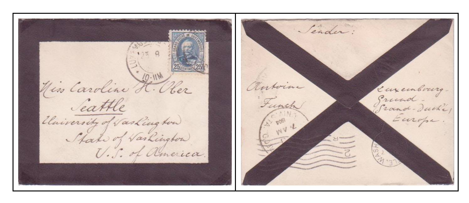
Fig. 3: Front and back of a mourning cover posted August 25, 1904, at the 25-centime UPU rate, backstamped Seattle, Washington, September 7<sup>th</sup>, and University Station, September 8, 1904.