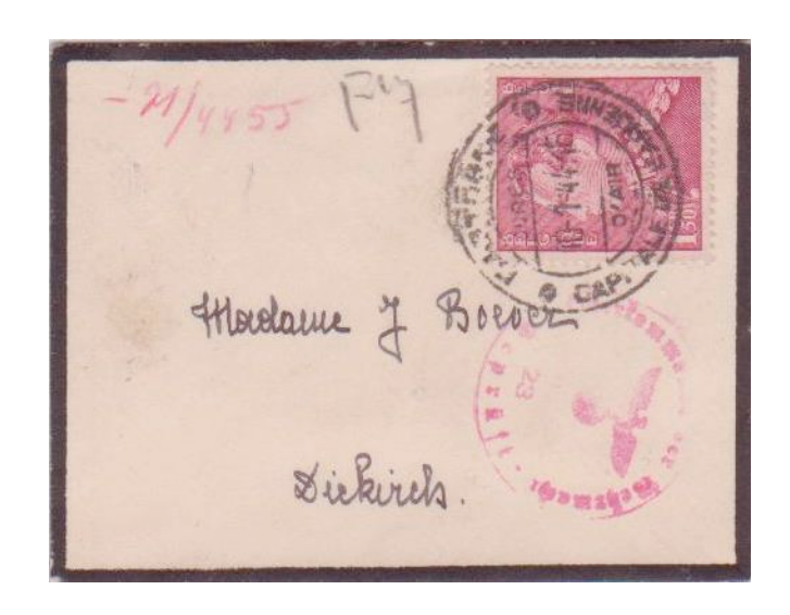
Fig. 6: Incoming mourning cover from Bastogne, Belgium, January 10, 1944, to Diekirch, Luxembourg, showing censorship by the German Wehrmacht.

I would welcome receiving scans of mourning covers from and to Luxembourg for my image library. You can contact me by e-mail at wichelman@gmail.com.