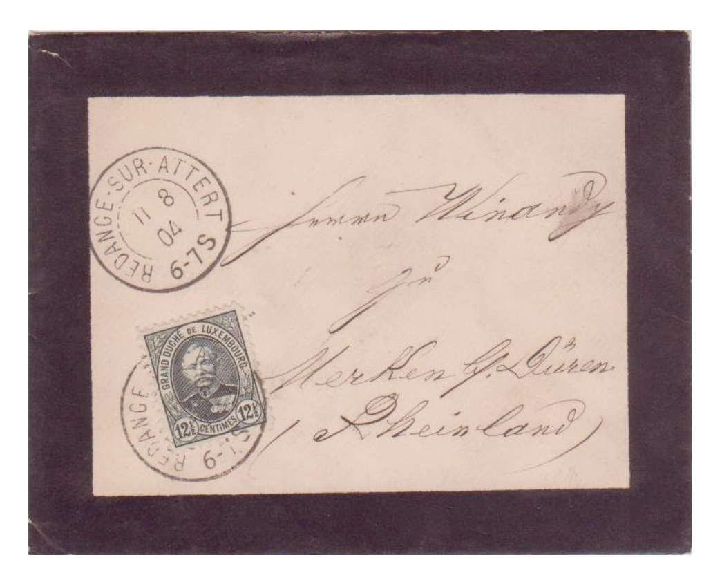
Fig. 2: Mourning cover from Redange-sur-Attert, posted August 11, 1904, at the 12 1/2-centime concession rate to Germany.