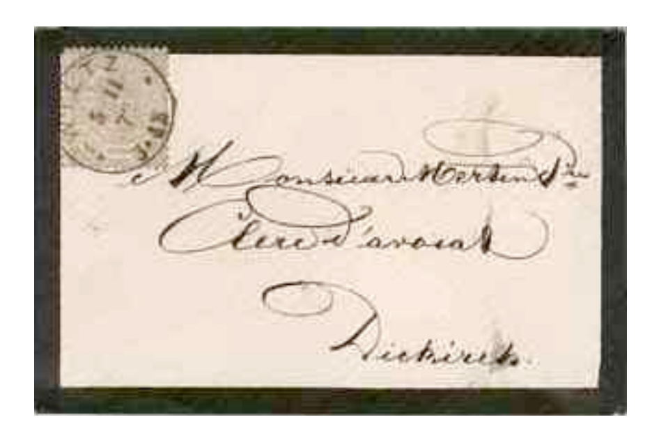
Fig. 1: Domestic mourning cover from Wiltz, November 5, 1877, to Diekirch, franked with a 10-centime definitive.