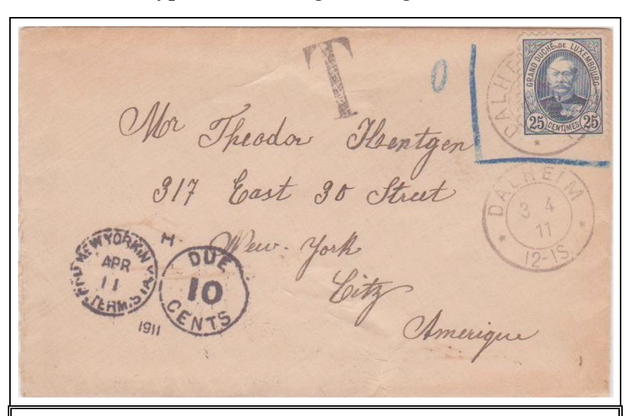
Type 1 — Franking No Longer Valid

T-1 — Invalid Use ( 25c 1891 Adolphe): Attempted use of the 25c definitive to pay the 20 g UPU rate on a letter to the United States from Dalheim, April 3, 1911.