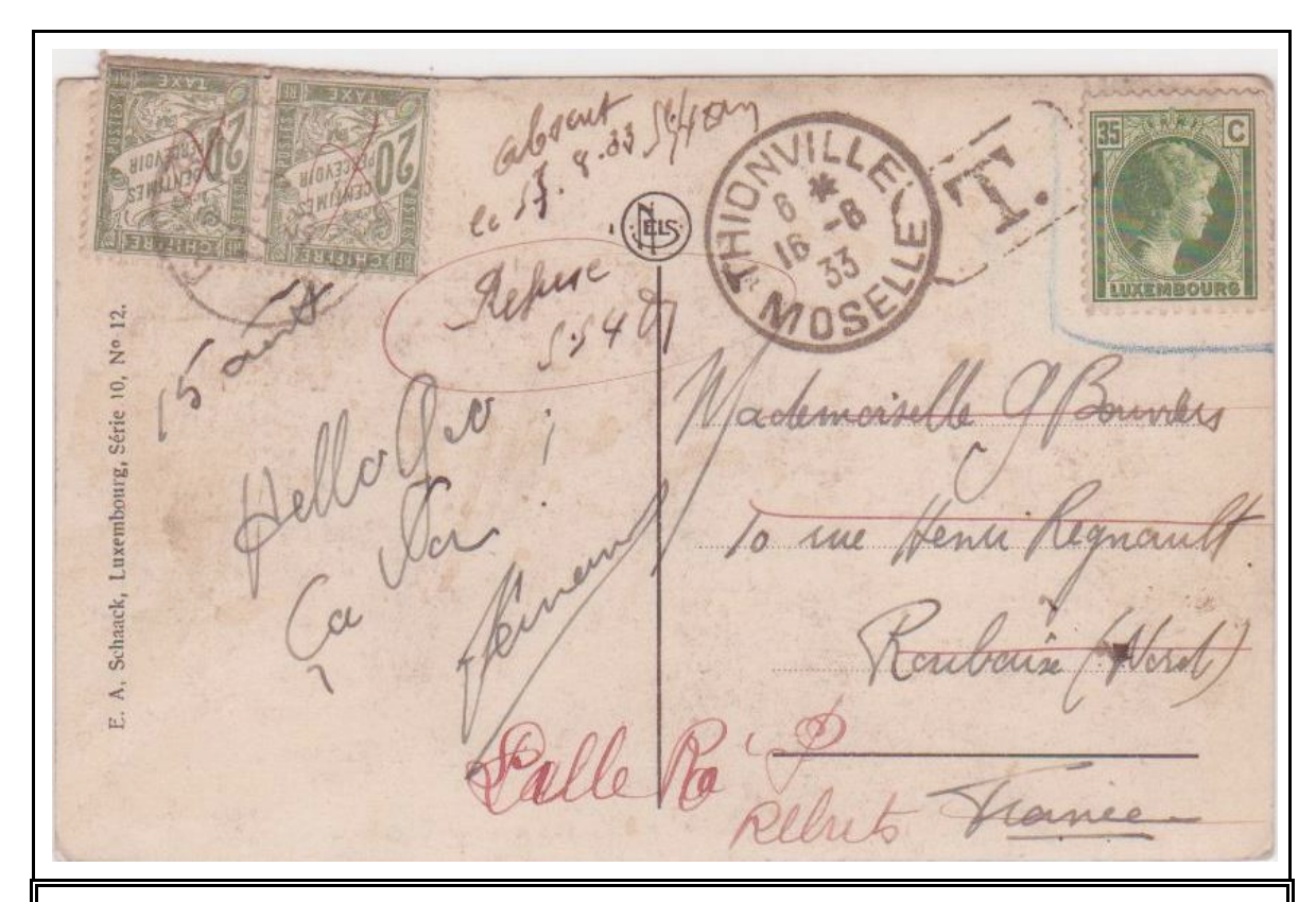
T-3 — Illegal Use in France: Attempted use of a 35-centime Charlotte definitive to pay postage on a viewcard sent from Thionville to Roubaix, France, August 16, 1933. The Thionville post office marked off the stamp with blue crayon to indicate its invalidity, taxed the card, and applied a pair of French postage due stamps. As the card was refused by the addressee, it was sent to the dead letter office in nearby Lille.