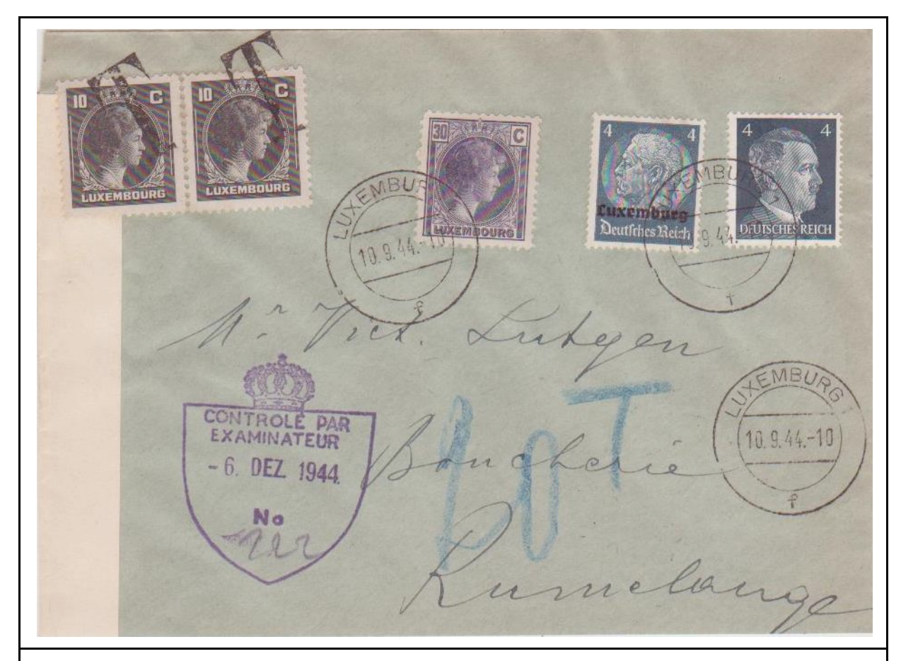
T-1 — Invalid use (30c Charlotte & 4 rpf. Hindenburg): Letter posted from Luxembourg-Ville to Rumelange, September 10, 1944, the day Luxembourg was liberated from WWII German occupation and 10 days after the Nazi administration in Luxembourg had collapsed. Although the letter was censored on December 6, 1944, domestic mail delivery to towns outside Luxembourg-Ville was not resumed until March 26, 1945. The March 26, 1945, Rümelingen backstamp shows that this letter was delivered on the first day that inland deliveries were permitted, 196 days after it had been posted.

Two of the stamps were invalid on the date of posting. The 30c 1926 Charlotte had been invalidated on October 1, 1940; the 4 Rpf. Hindenburg on January 1, 1942. The 4 Rpf. Hitler head remained valid until September 29, 1944. However, as the letter rate was 12 rpf., the Rumelange post office only charged postage due for a 1 Rpf. deficiency in the franking after giving the sender 11 Rpf. credit for the three stamps. (The 30c Charlotte was converted to reichpfennings at the rate of 10 centimes to 1 Rpf., thus being worth 3 Rpf.) The 20-centime postage due charge reflects the 1 Rpf. deficiency doubled.