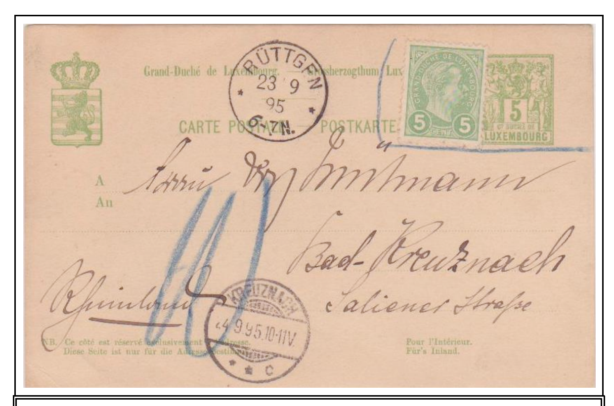
Type 3 — Luxembourg Franking Used Abroad

T-3 — Illegal Use in Germany: Attempted use of a five-centime 1882 Allegory postal card uprated with a 5-centime 1895 Adolphe definitive to pay postage from Rüttgen to Bad-Kreuznach, Germany, September 23, 1895. At that time, Rüttgen was part of the German Lorraine, on the German side of the border with Luxembourg. Today it is part of France and known by its French name, Roussyle-Village.