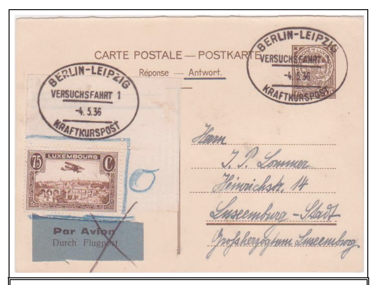
Type 2 — Franking Invalid for Service Requested

T-2 — Airmail Use Disallowed: Reply card from a 75c+75c Luxembourg Ècusson double card mailed May 4, 1936, on the special German automobile postal service between Berlin and Leipzig with a blue Luxembourg airmail label and 75c Luxembourg airmail adhesive added purporting to pay supplemental postage for return of the reply card by airmail.