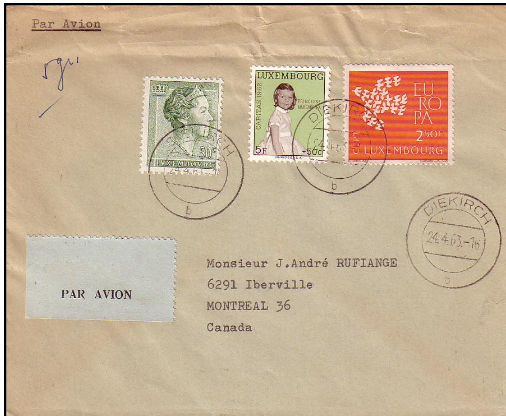
24.4.1963 Diekirch to Montreal, Quebec, Canada 8.00 F = 5.00 F (letter, 1 st weight class) + 3.00 F (airmail fee, 1 st weight class) Airmail fee: 3.00 F per 5 g = 3.00 F for this 5 g letter