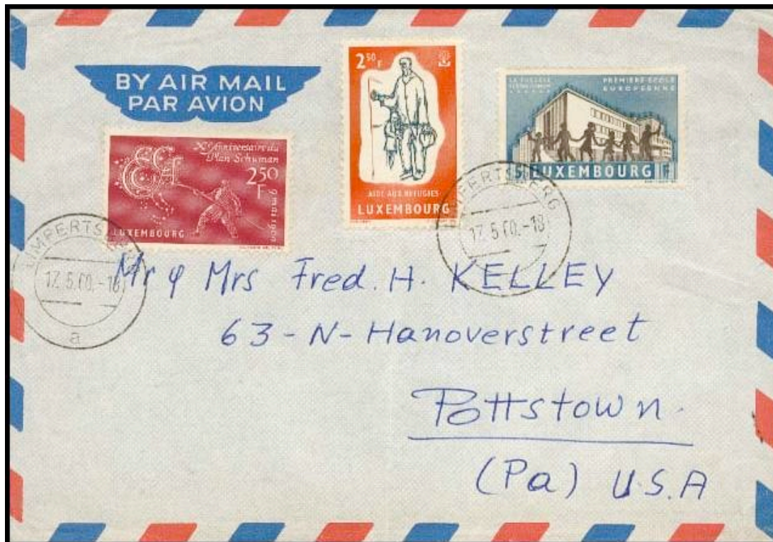
17.5.1960 Limpertsberg to Pottstown, Pennsylvania 10.00 F = 5.00 F (letter, 1 st weight class) + 5.00 F (airmail fee, 2 nd weight class) Airmail fee: 2.50 F per 5 g = 5.00 F for this 5-10 g letter