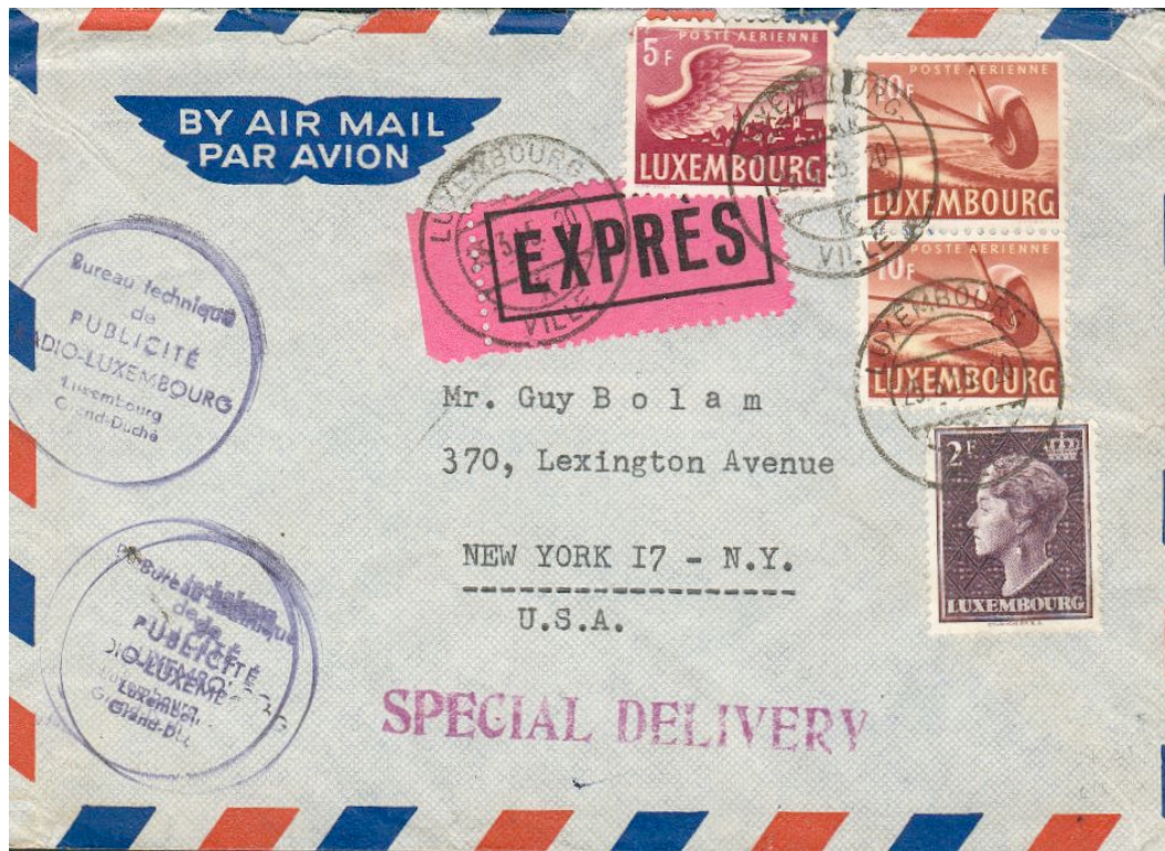
25.3.1955 Luxembourg-Ville to New York, New York 27.00 F = 6.50 F (letter, 2 nd weight class) + 8.00 F (special delivery) + 12.50 F (airmail fee, 5 th weight class) Airmail fee: 2.50 F per 5 g = 12.50 F for this 25-30 g letter