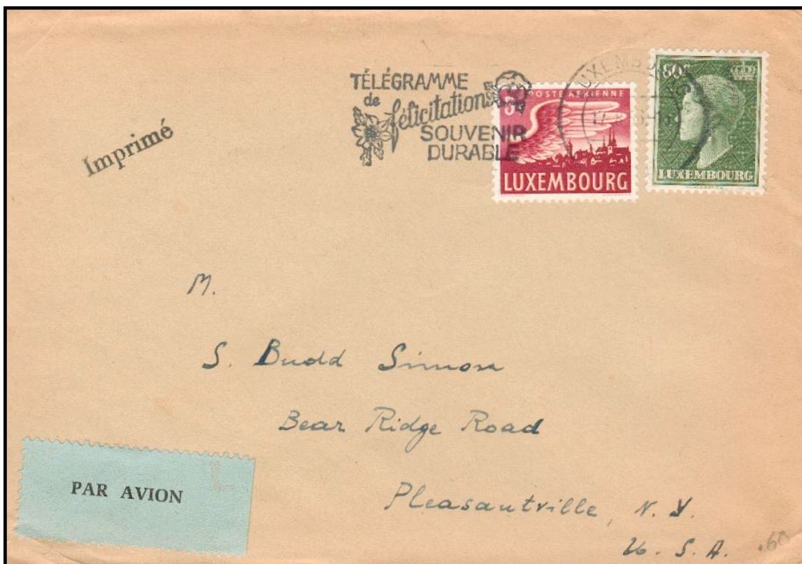
17.8.1956 Luxembourg-Ville to Pleasantville, New York 5.80 F = 0.80 F (printed matter, 1 st weight class) + 5.00 F (airmail fee, 2 nd weight class) Airmail fee: 2.50 F per 5 g = 5.00 F for this 5-10 g letter