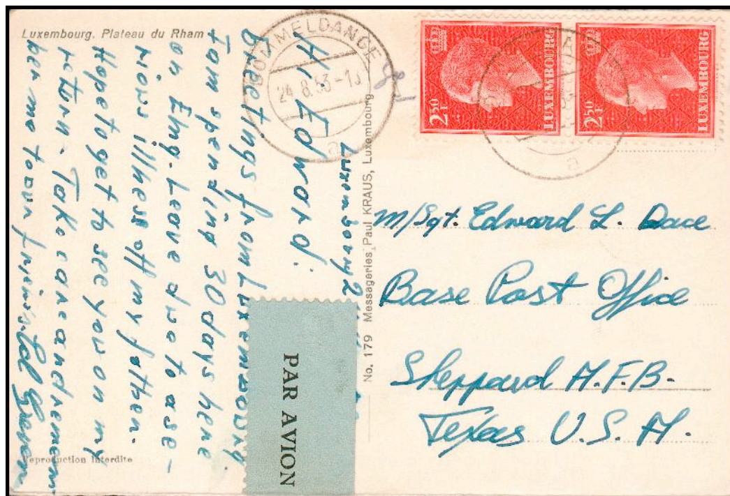
24.8.1953 Dommeldange to Sheppard Air Force Base, Texas 5.00 F = 2.50 F (postcard) + 2.50 F (airmail fee, 1 st weight class) Airmail fee: 2.50 F per 5 g = 2.50 F for this postcard