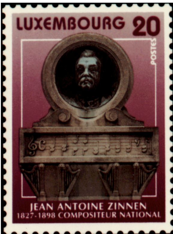
Jean Antoine Zinnen (1827-1898)

The highlight of the day is a colorful parade along the main street of the upper town, which passes by the Wiltz Castle shown in the background of the stamp.