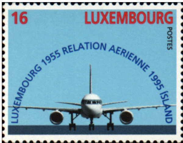
Icelandair (1995 stamp).

Icelandair, formerly Loftleidir or Icelandic Airlines, has played an important role for over 40 years in establishing Luxembourg as a popular tourist destination and raising the level of awareness of the Grand Duchy and its unique charms.