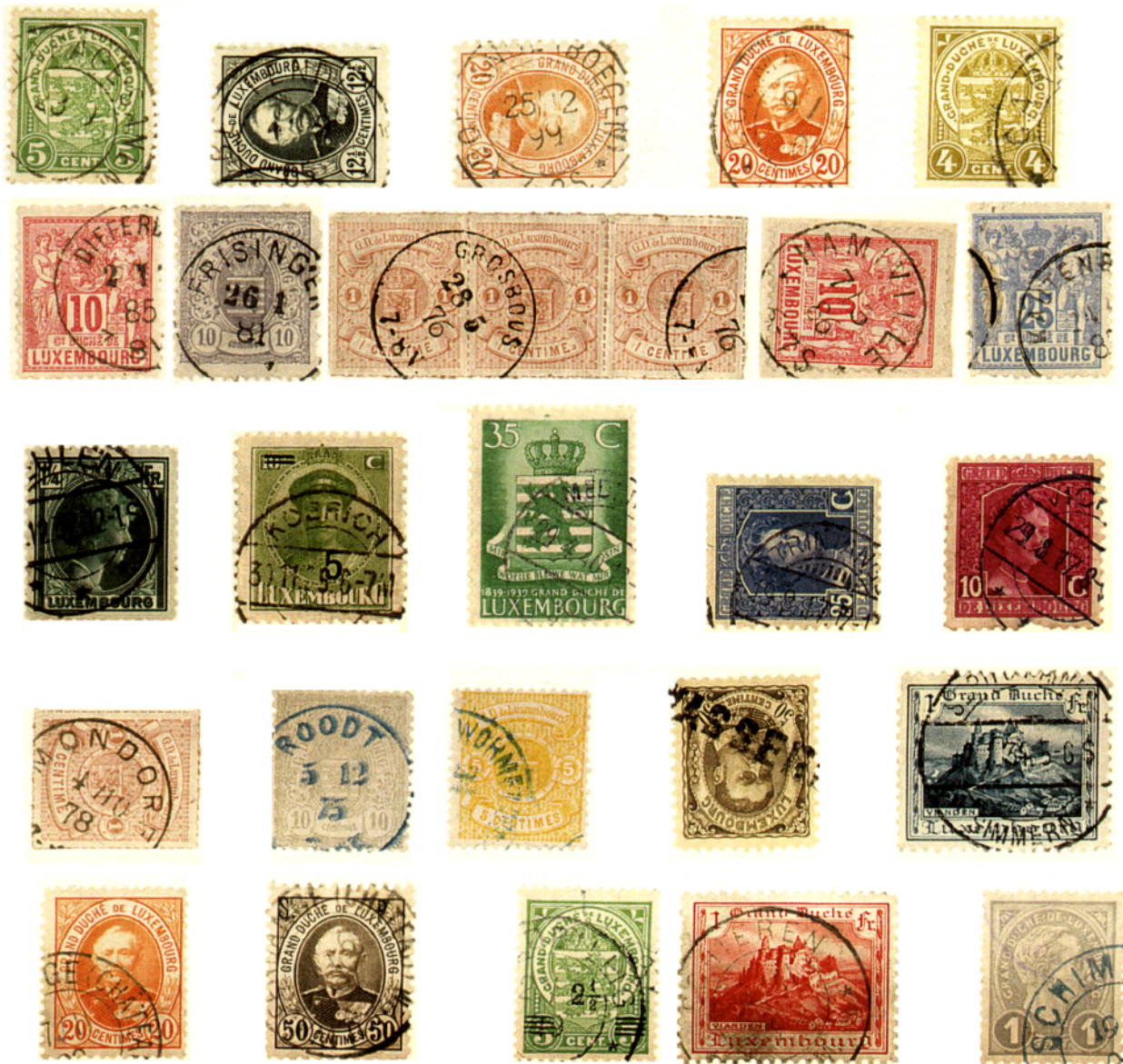
Interesting and rare Luxembourg postmarks.