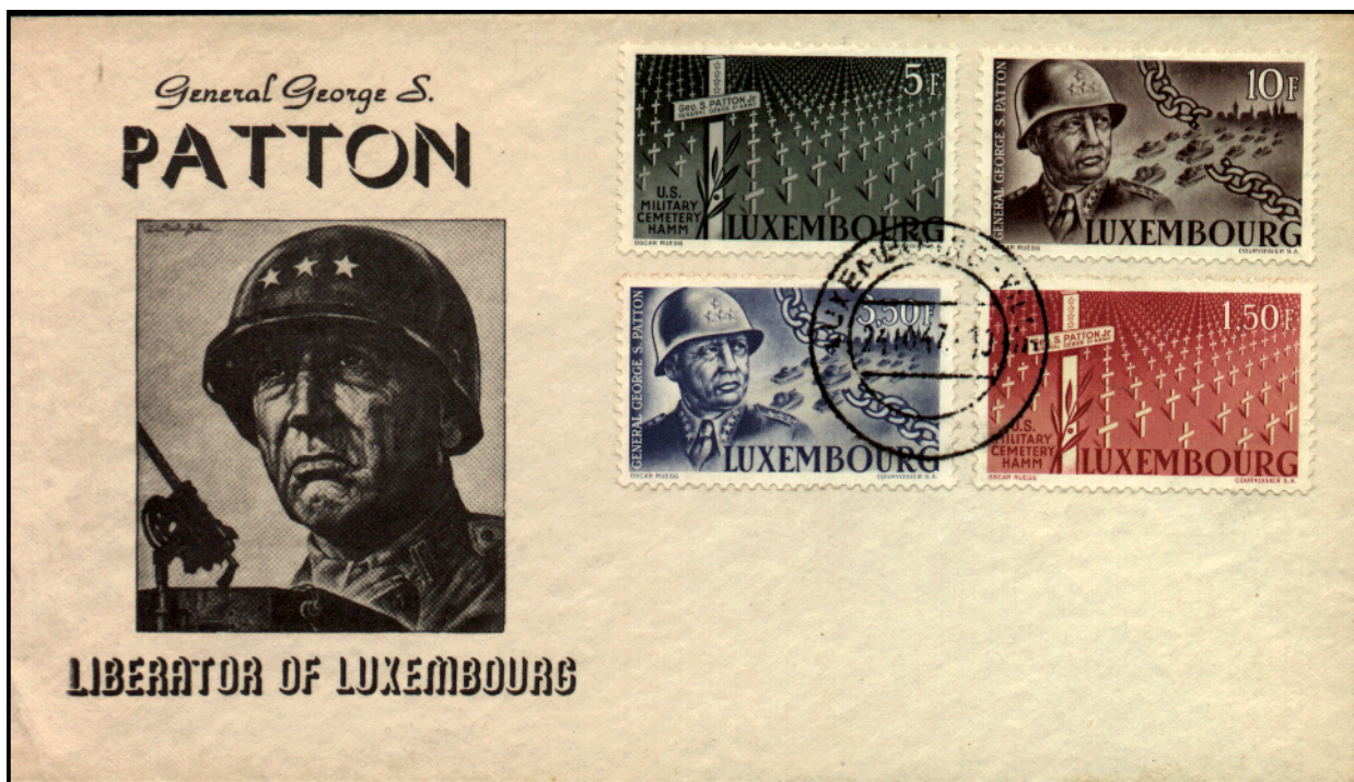
Patton first day cover from 1947.