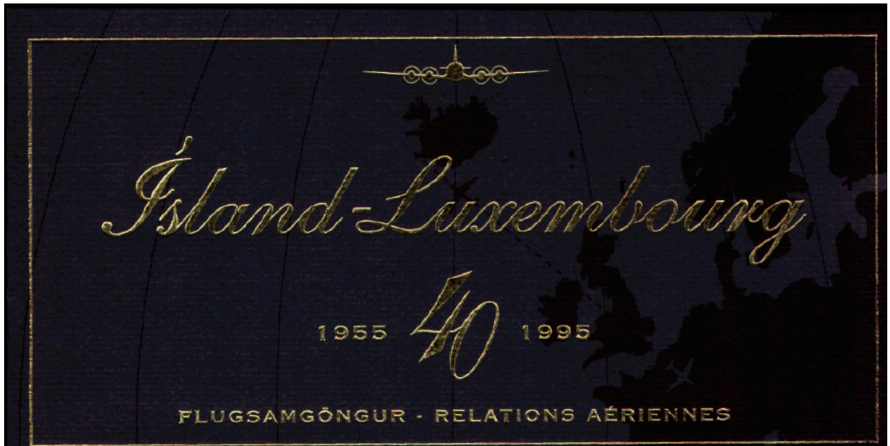
Presentation booklet for the Iceland-Luxembourg aviation relations stamps.

Write for Castellum! We need your interesting articles, short or long, on all topics related to Luxembourg and its collectibles. If you've got a philatelic gem in your collection, please take the time to tell your fellow members all about it. Send articles to the Luxembourg Collectors Club, 3304 Plateau Drive, Belmont, CA 94002. Electronic submissions are especially welcome (send them to lcc@luxcentral.com ).