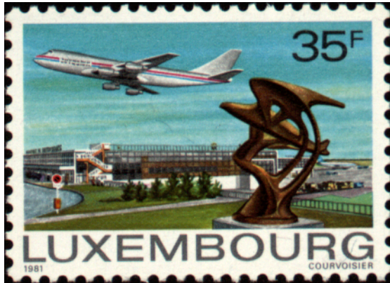
Findel Airport and the statue by Charlotte Engels (1981 stamp).

Findel opened to international air traffic in 1946. At the time, the airport had one small terminal building and supported only a limited number of flights to a few European cities. Over the years, however, its facilities have been greatly expanded and improved to meet the needs of modern aircraft and increased traffic volume.