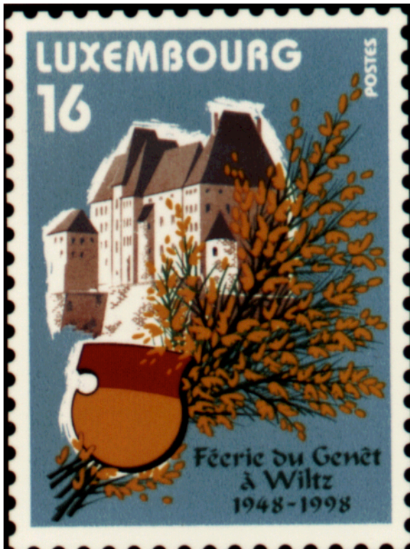
Wiltz Broom Festival