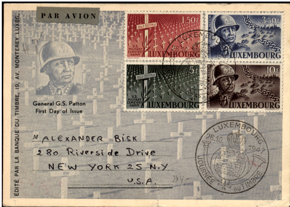
American Military Cemetery in Hamm (1947 stamps).

Not far from Luxembourg City's Findel Airport is the serene American Military Cemetery in Hamm, a grim reminder of the many American soldiers and support personnel who died defending Luxembourg soil during World War II. The cemetery is featured on two of the set of four stamps issued by Luxembourg on October 24, 1947 to honor the memory of U.S. General George S. Patton, Jr.