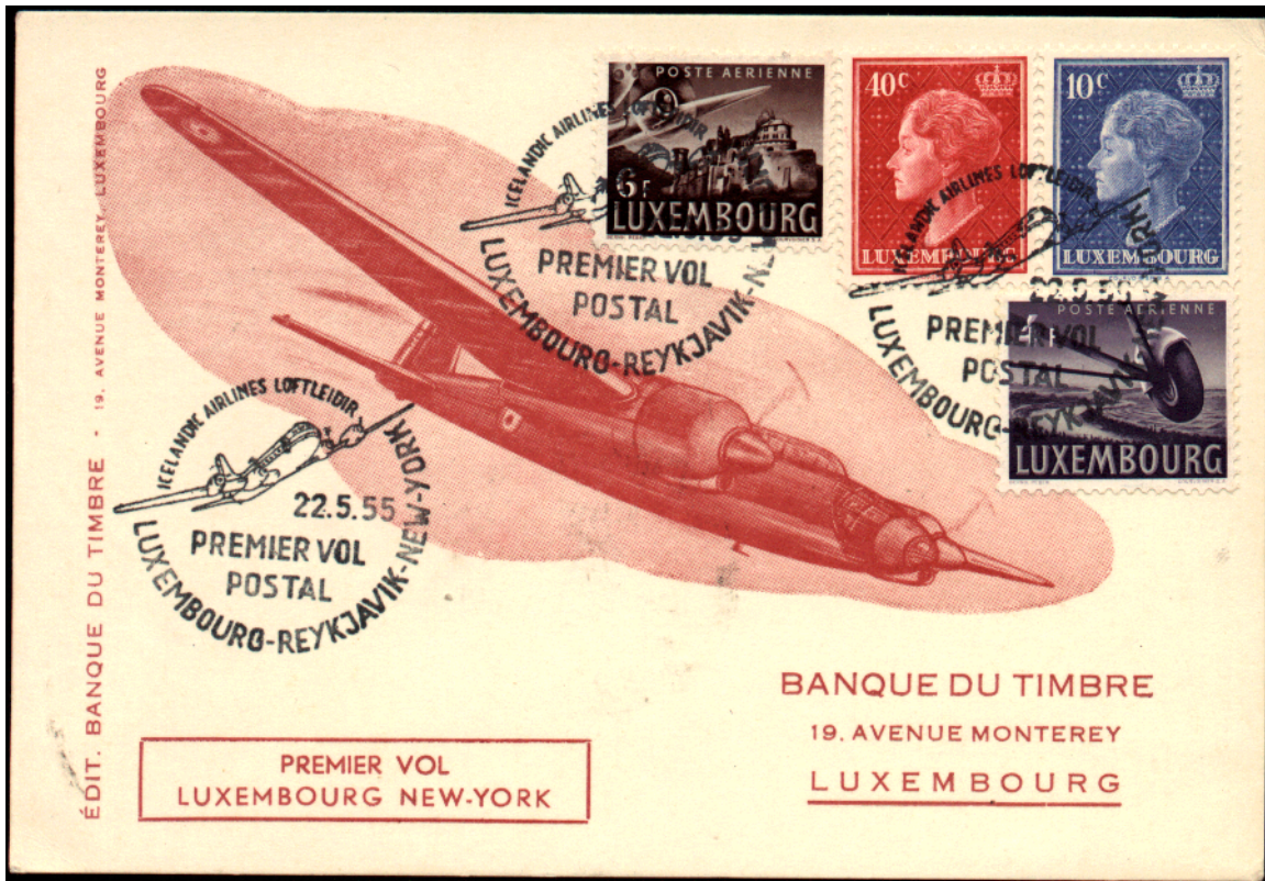
The first Icelandic Airlines flight between Luxembourg and New York was on May 22, 1955.