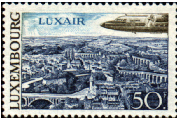
Luxair (1968 stamp).

Near the terminal building is a modern sculpture by Luxembourg artist Charlotte Engels depicting a bird in flight. It was erected in 1977. It is pictured in the foreground of the stamp.